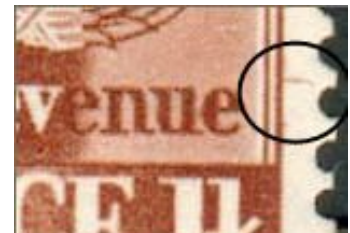
2C4D (Brown line extending from right frame into gutter above REVENUE)