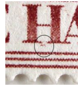
3C3F (Small brown mark below 'H' of HALF)