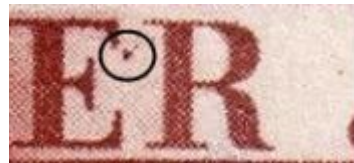
3C4B (Comet between 'ER' of SILVER)