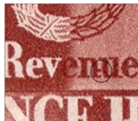
2C3B (Dot between 'NU' of REVENUE)