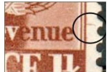
2C4D (Brown line extending from right frame into gutter above REVENUE)