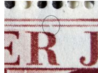
3C3C (Break in inner brown line above 'R' of SILVER)