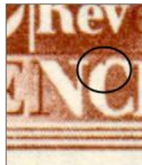
2C4B (Coloured mark in 'C' of PENNY)