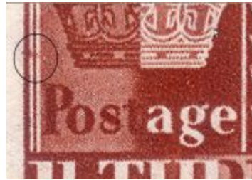
3C3B (Coloured mark in left margin by Crown)