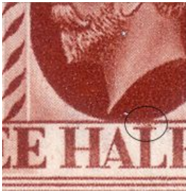
3C3A (Coloured mark over 'L' of HALF)