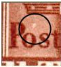
2C4A (White mark over 'O' of POSTAGE)