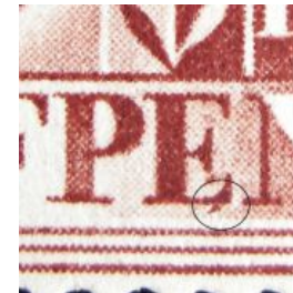
3C4C (“Barb” at base and extending below on first 'E' of PENCE)