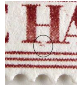
3C3F (Small brown mark below 'H' of HALF)