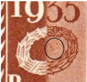
3C4A (Retouch in wreath)