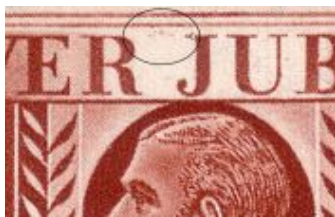
3C1C (Coloured mark between 'R' and 'J' of SILVER & JUBILEE)