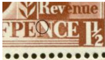
3C1D (Small white dot at top of upper limb of 'N' of PENCE)