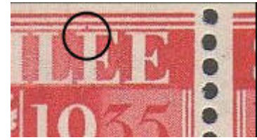
3B2B (Coloured dot above first 'E' of JUBILEE)