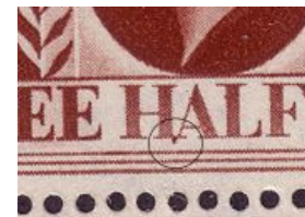
3C2A (Brown mark at base of letters – joins 'HA' of HALFPENCE)