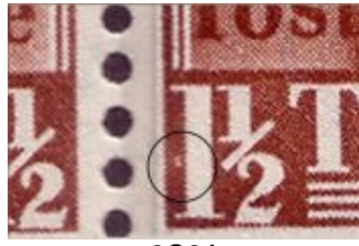
2C2A (White dot before '1' of 1½d on lower left)