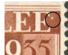
3C1B (White dot after last 'E' of JUBILEE)