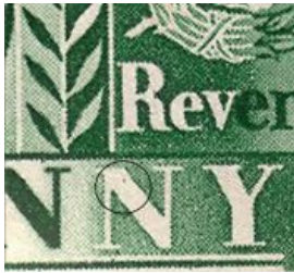
3A4A (Green dot at top of diagonal of second 'N' of PENNY)