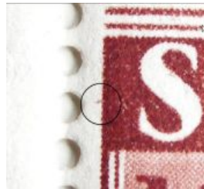
3C3E (Brown spur at left margin by 'S' of SILVER)