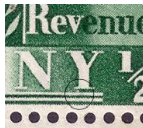
3A2A (Small white dot below 'Y' of HALFPENNY)