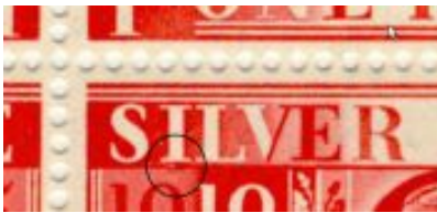
3B4A (Retouch below 'I' of SILVER)