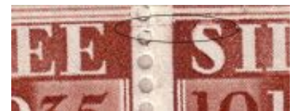
3C2D (Brown horizontal line in top of 'S' of SILVER extending from stamp 1 of pane)