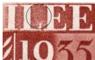
3C2C (“Gas cloud” light area over serif of 'L' between 'LE' of JUBILEE)