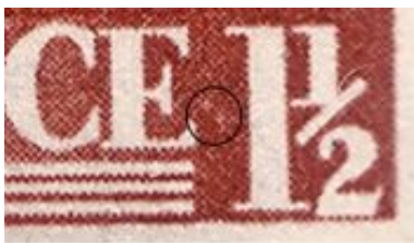
2C3A (Two white dots after last 'E' of PENNY)