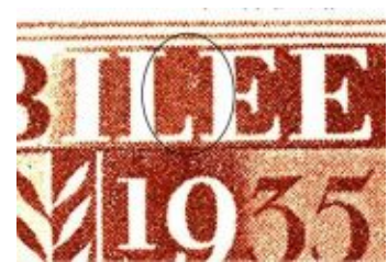
2C3C (? Retouch between 'LE' of JUBILEE)