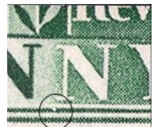
3A3A (White dot on upper green line below second 'N' of PENNY)