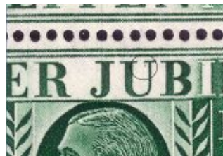
3A3A+ (Green apostrophe inside 'U' of JUBILEE below right serif)