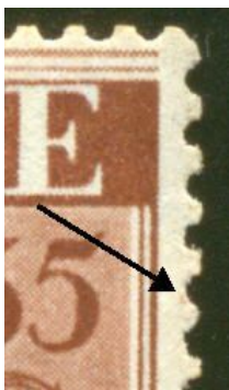
3C2B (Brown dot on 6 th perf tooth from top on right side)