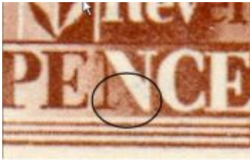
2C1J (Right slanting diagonal line from foot of 'N' in PENNY)