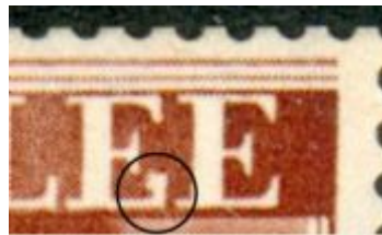
3C1A (White mark on lower serif of first 'E' of JUBILEE)