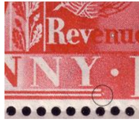
3B2A (Small white dot at right hand end of double line white lines at base)